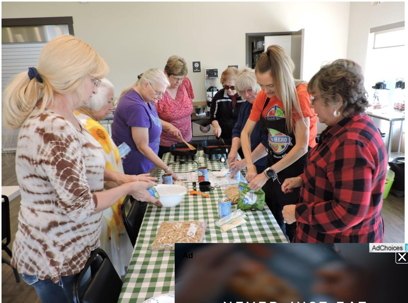
Seniors make pasta with beans and greens during a Cooking Matters class at the Senior Center in Hermiston on Wednesday.