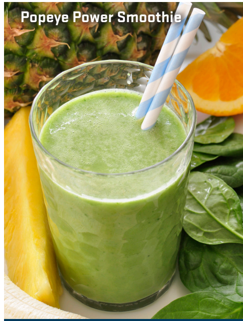
Popeye Power Smoothie

“This is so good, crazy good, can I have the recipe? I want this every day for breakfast.”