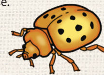
Mexican Bean Beetle